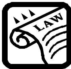
Township Ordinances are considered Law and as such must be complied with.

Township Ordinance 106 was passed January 2, 1996 and sets a number of requirements for residents to display their house number to provide better response times by the police, ambulance and