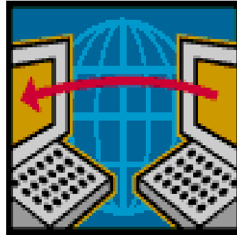
Communicating with you is a primary goal in launching the Penn TownshipWebsite